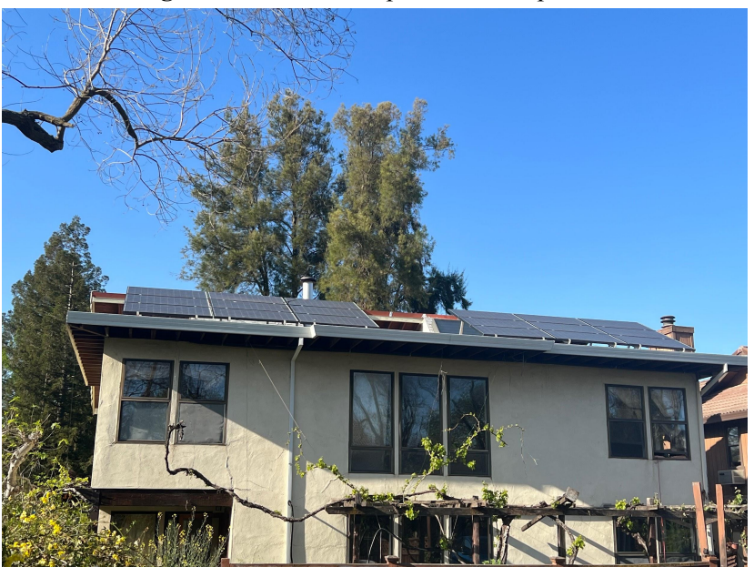
Figure 3. Sunwise Cooperative solar panels.