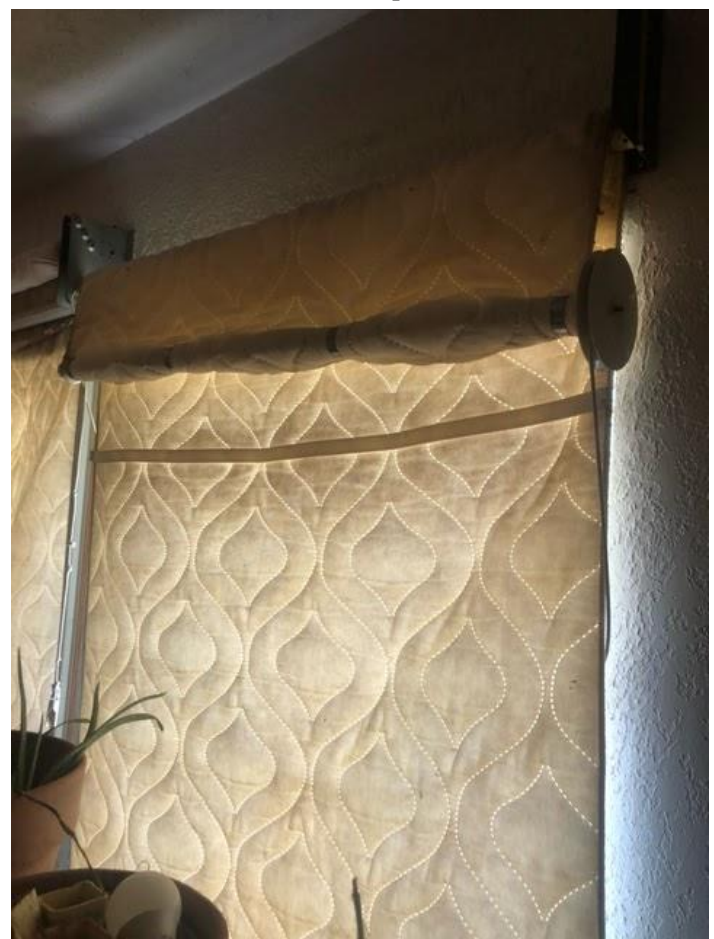
Figure 1. Sunwise Cooperative has several thermal curtains. Some thermal curtains or curtain rods are in need of repair.