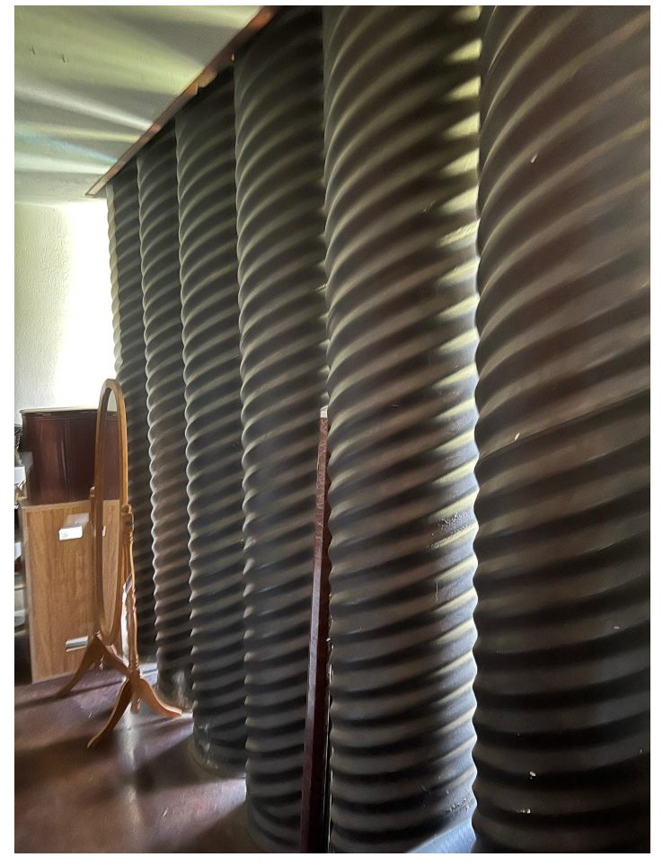
Figure 2. Sunwise Cooperative thermal storage pillars.